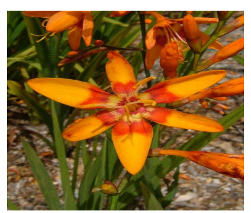
Prometheus Crocosmia Flower