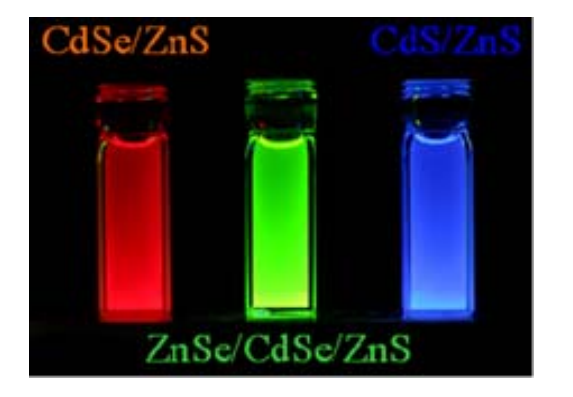
- Change of coulour in nano-particles-